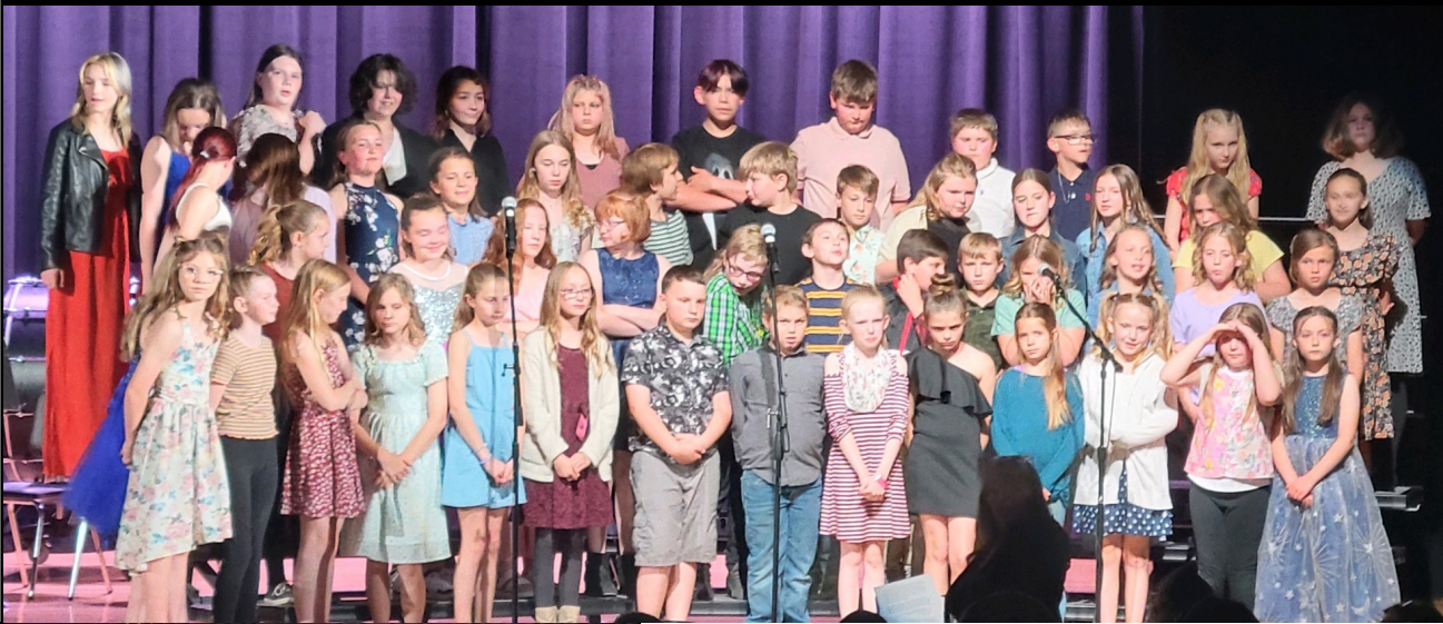
Tuscarora Elementary had their Band and Chorus Concert on May 18th at 7:00 PM. Everyone did a wonderful job!