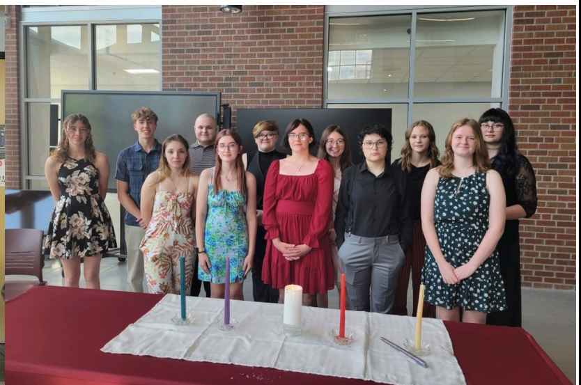
National Honor Society Inductees 2023-2024